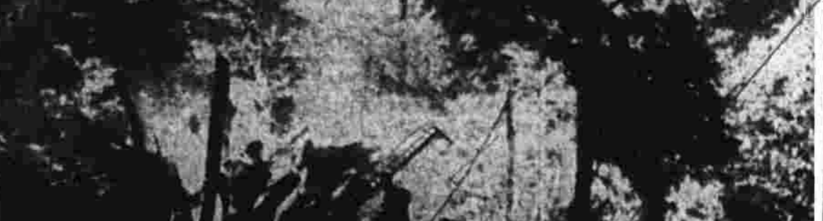
Police, Army officials and civilians cluster about the burned and twisted wreckage of an Army B-29 in which eleven died when it crashed into Hawks Mountain near Springfield, Vt.